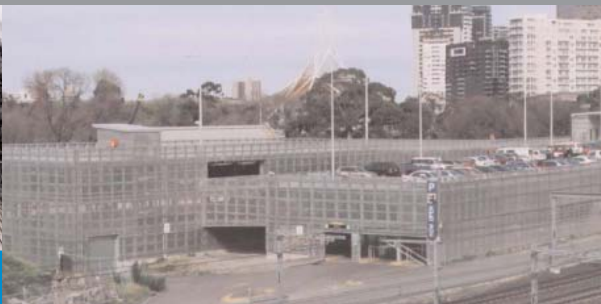
Right: Federation Square Car Park designed for light and transparency