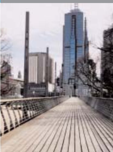
Above: A galvanised pedestrian bridge structure

The modern car park provides the transition from personal to public transport. These transport hubs link car use to anything from pedestrian thoroughfares to flying. Inner city dwelling is also a growing factor in the need to park cars more efficiently. "Galvanize" case studies in this issue highlight the architectural achievements evolving from upgrading strictly utility structures to unobtrusive and functional civic buildings.